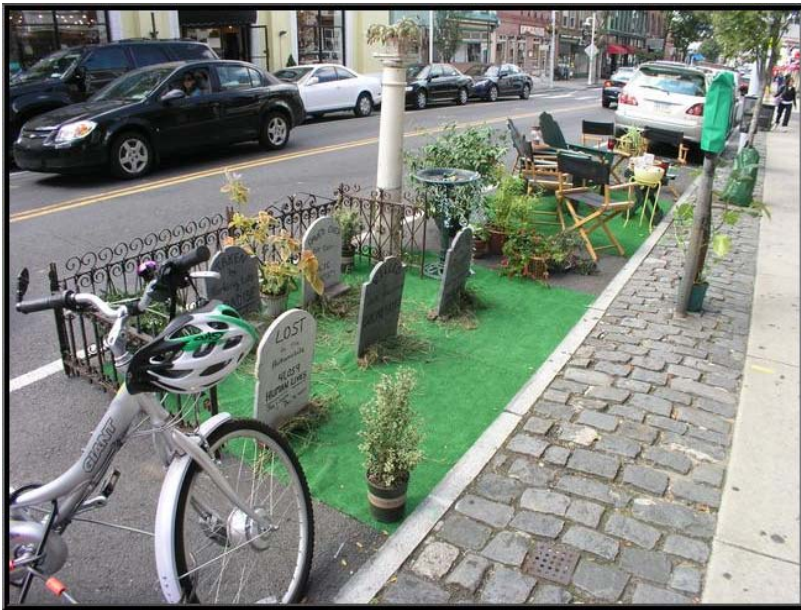
Parking Day 2008 on Main Street

Stay informed of current events by joining the MNC email list: www.manayunkcouncil.org/email.html