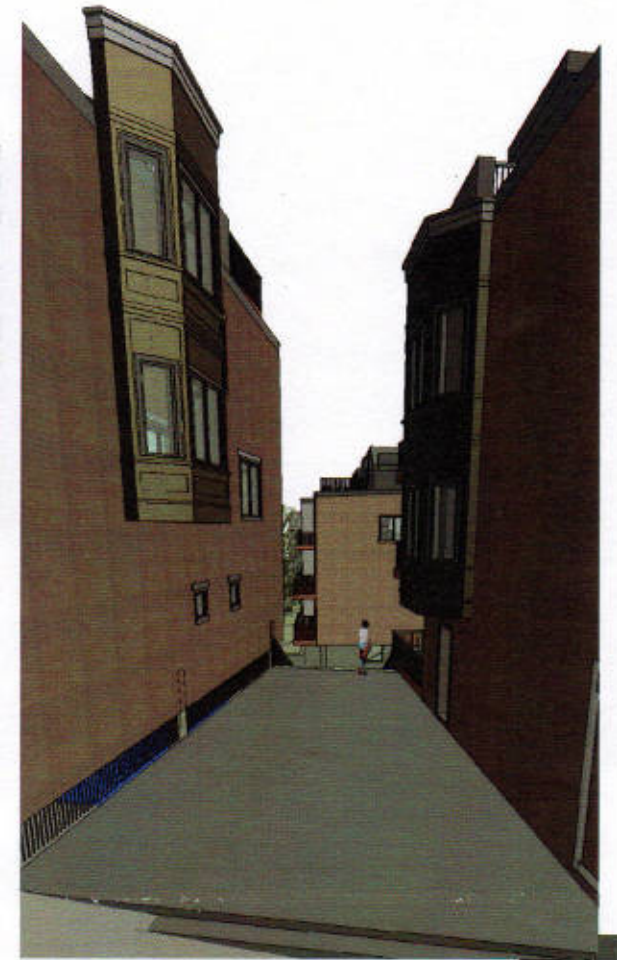
③ Looking down the grand stairway