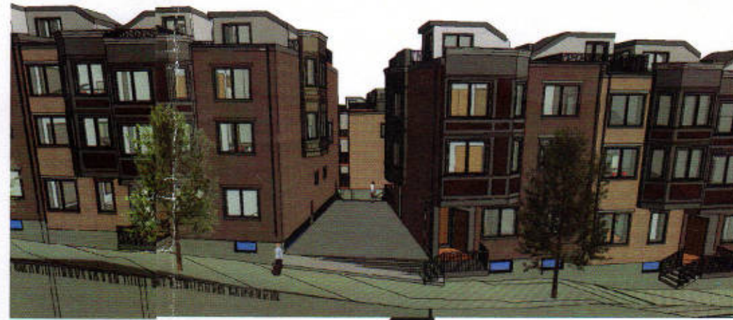
⑥ Looking down grand staircase from across the street