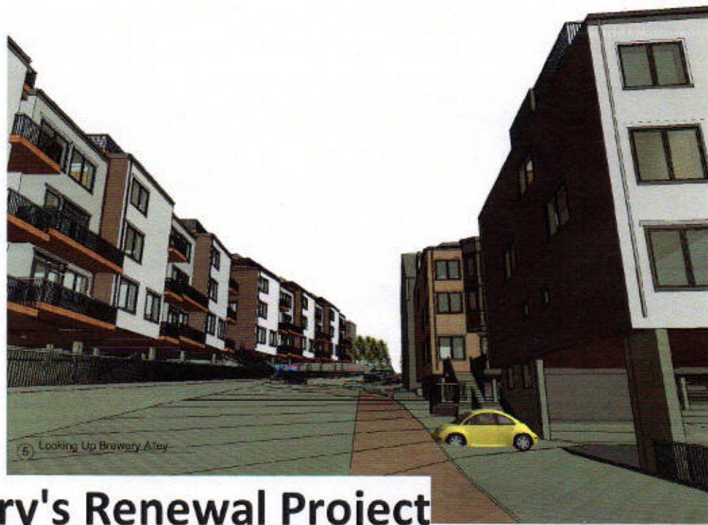
⑤ Looking Up Brewery Alley