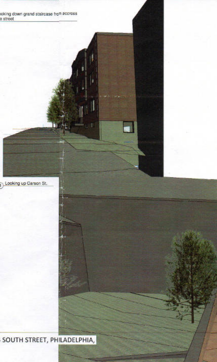
④ Looking up Carson St.